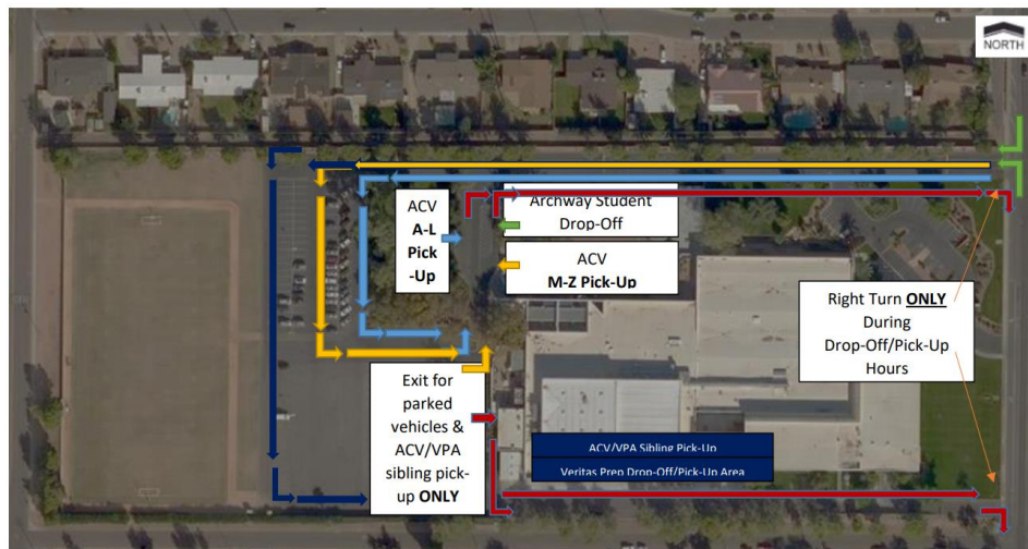
2018-19 Traffic Flow Map

Student parking is available for student drivers who register and obtain a permit (available on www.Academyprep.configio.com under the back-to-school section). Student parking spaces are marked in blue; students are not permitted to park elsewhere.